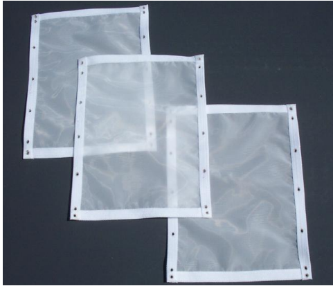
Example Picture of A-55 Filter Set

Stock Filters Include; Makino A-88, A-55, A-55E, A-51 & Mori Seiki NH 5000 Other Types Available Upon Request With Sample Provided.